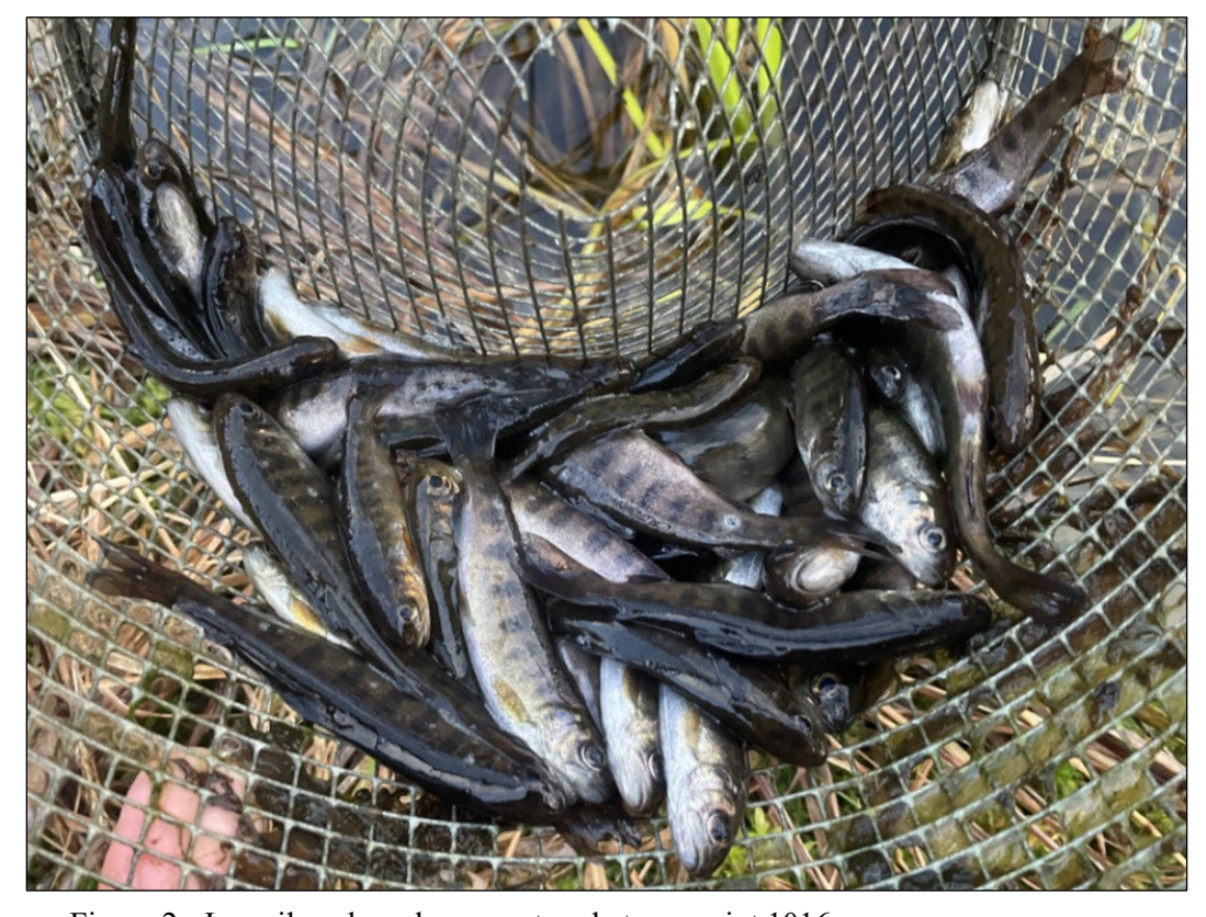
Figure 2.-Juvenile coho salmon captured at waypoint 1016.