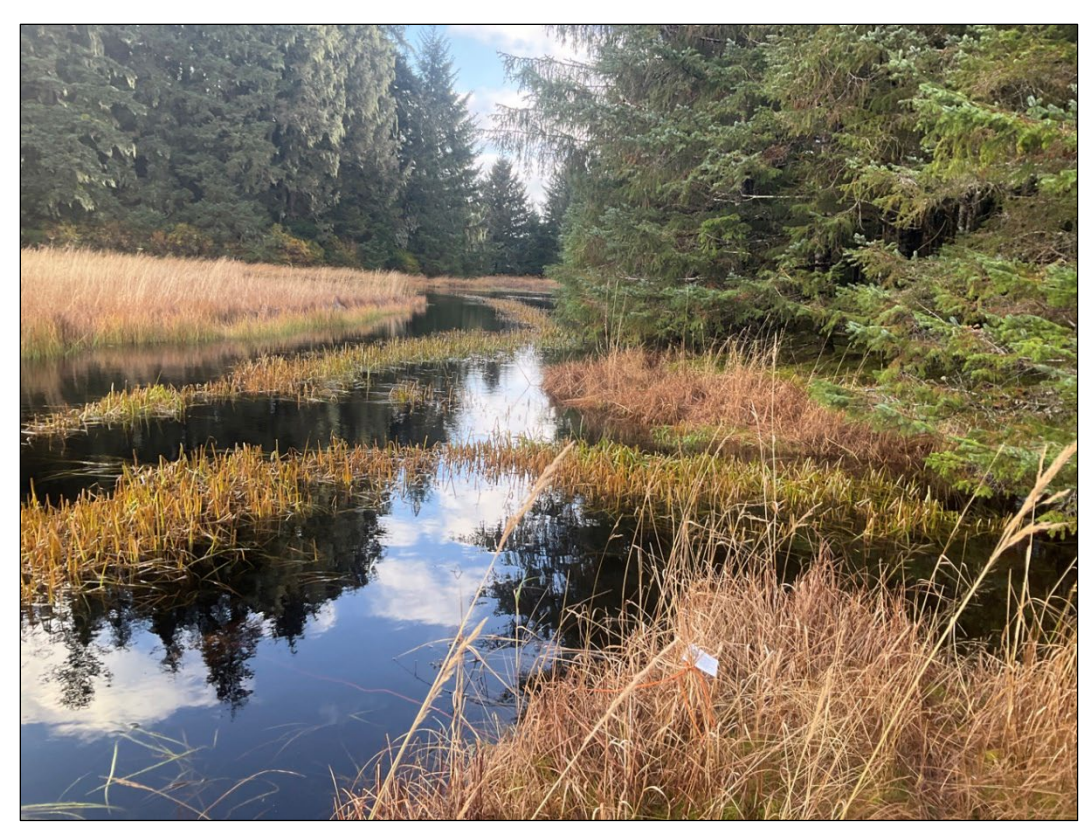
Figure 1.-Downstream view of tributary 1 at waypoint 1017.